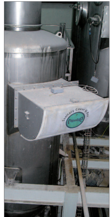
Q-Box II application in the food industry: the sanitary cover protects the exterior of the Q-Box II; keeping it clean from the outside